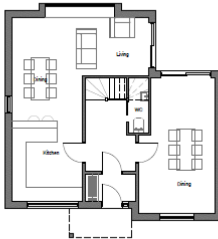
PROPOSED GROUND FLOOR PLAN SCALE 1:100 @ A3 SCALE 1:50 @ A1